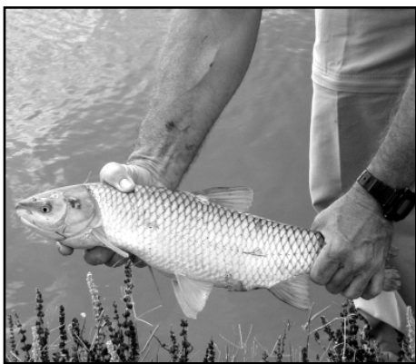
Figure 1. A grass carp.

relatively large scales; the head is broad and the belly rounded (Fig.1). The dorsal and anal fins are short with no spines and the caudal fin is deeply forked. Their jaws have simple lips with no teeth and they have no barbels (i.e., whiskers). Like other Cyprinidae, grass carp have pharyngeal teeth (i.e., in the throat). These pharyngeal teeth are in two rows and enable the grass carp to cut/shred the vegetation it consumes. Their flesh is white, firm and not oily, but the muscle mass contains "Y" bones. Grass carp flesh is considered a delicacy by many seafood enthusiasts.